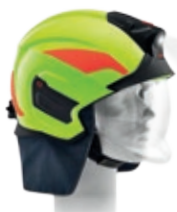
157385 + 157349