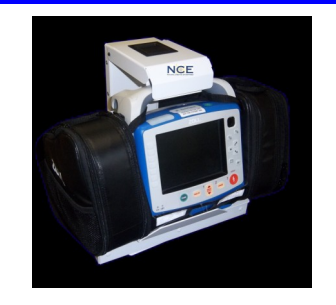
INQUIRE ABOUT OUR WALL MOUNT TODAY

NCE Mounts provide the maximum protection for your Zoll defibrillator, minimizing the risk of costly repairs due to device impacts or falls during transport. More importantly, these mounts will protect your EMT's from flying defibrillators in the event of a sudden stop, accident or roll-over.